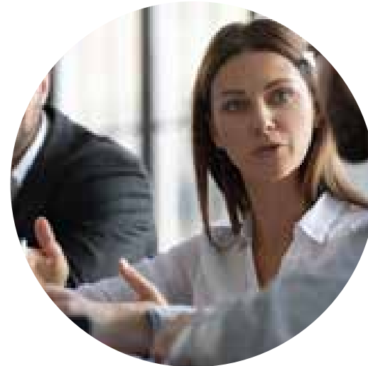
Community Development Financial Institutions (CDFI) Loan Participation Program