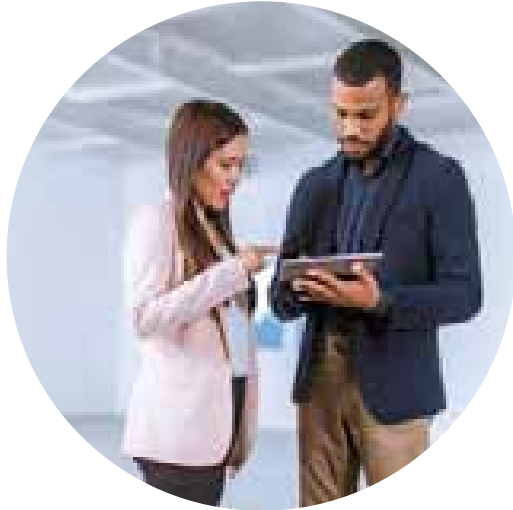
Collateral Enhancement Program (CEP) 2.0