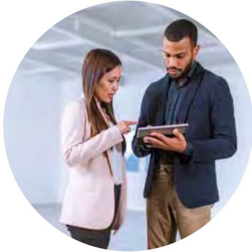
Collateral Enhancement Program (CEP) 2.0